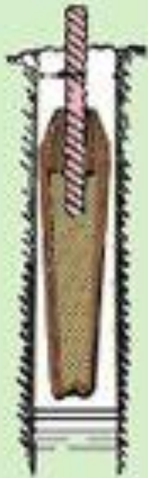
1. Early type

(introduced drilling hole with nitroglycerine)