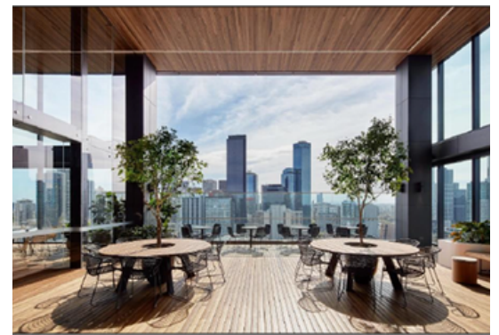
Rooftop educational and conference space to be included in Bayshore Pavilion expansion.