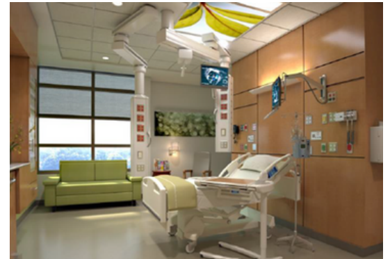
Bayshore Pavilion vertical expansion will add 12 operating rooms and 100 ICU capable inpatient beds.