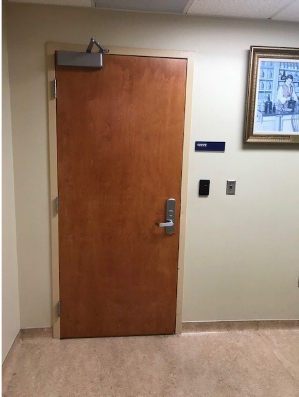
Main entrance to the Inpatient Pharmacy. It is located on the second floor of Tampa General Hospital, room F222E