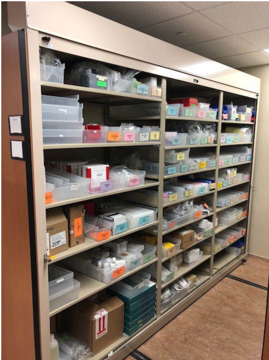
Rolling shelf storage for room temperature medications. The front cover pulls down and is kept locked when not in use.