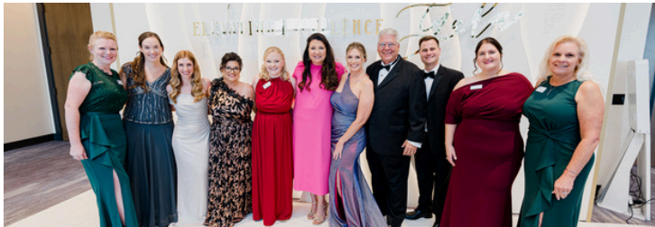
The TGH Foundation team is excited to shop for the 2025 Gala at Dillard's on Sept. 5 and 6!