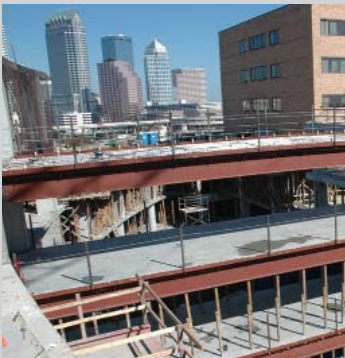
Expansion project: Walkways on the fifth and sixth floors and on the roof extend over the building's open courtyard. Located on the fourth floor, the courtyard will provide a quiet place of reflection for patients and visitors.